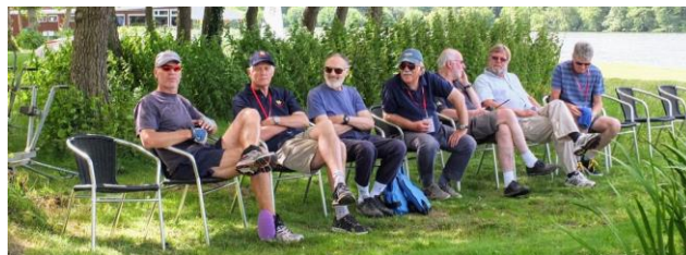
Racing sailors and relaxing helpers