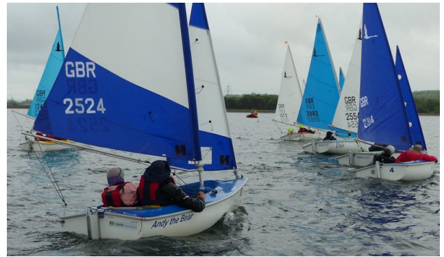
303 start Oxford TT

took to the water in unseasonably cold, wet and windy conditions.