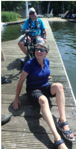
Helpers and sailors enjoying the day.