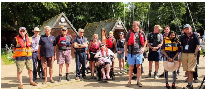
Sailors at the pre-event briefing