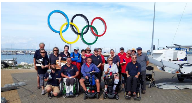
The Frensham Team down at Weymouth