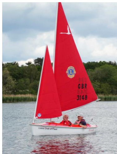
‘Miranda’ on it’s inaugural sail