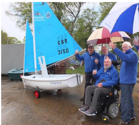
‘Hedgehog’ with members of The Hedgehogs